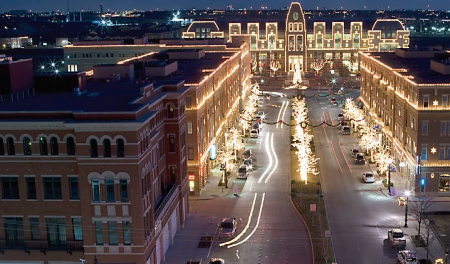
Christmas shines at Frisco Square