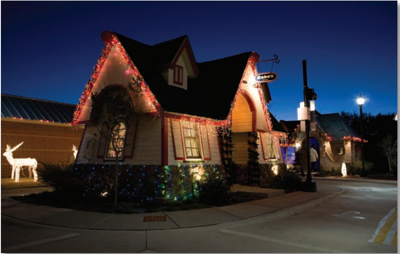
Safety Town glitters bright for Christmas