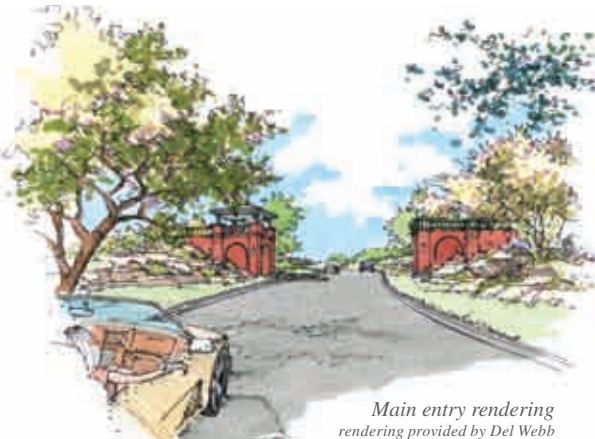
Main entry rendering