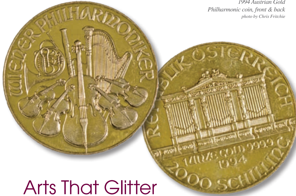
1994 Austrian Gold Philharmonic coin, front & back