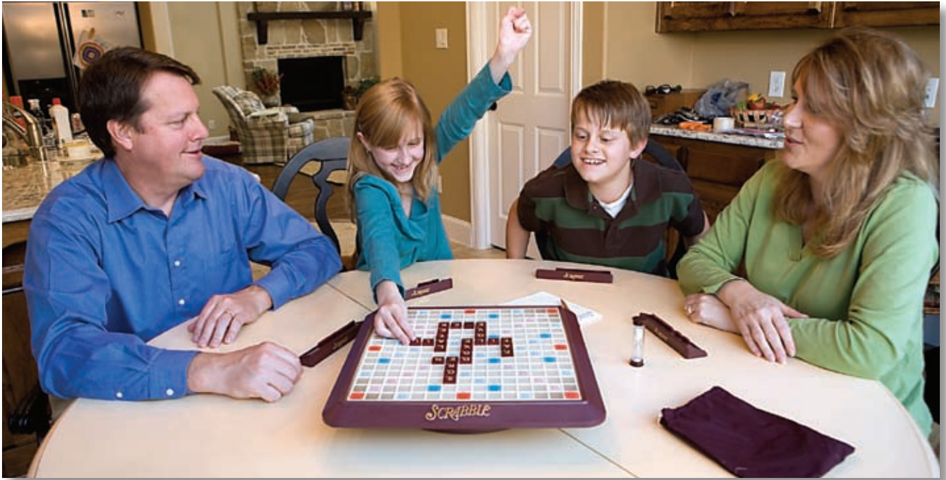
Game night can occasionally incorporate learning along with family fun.