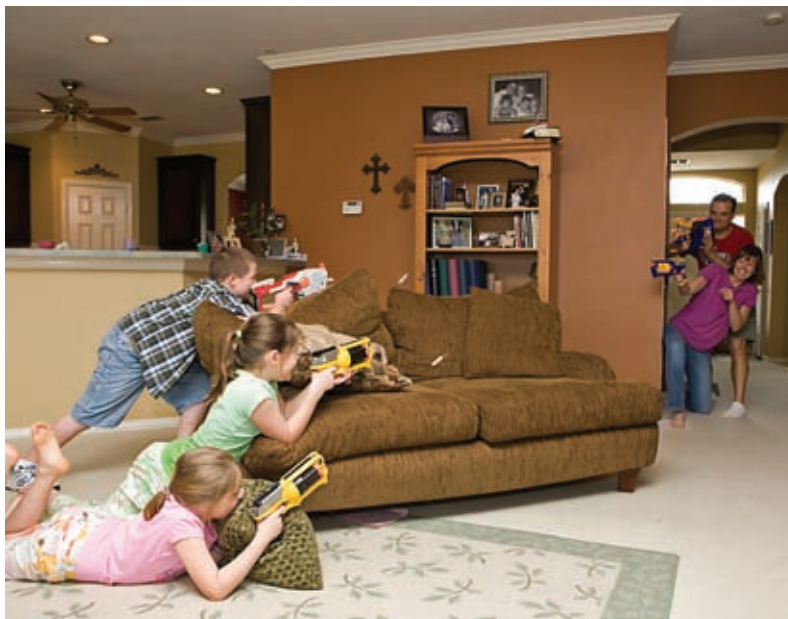
Time together is the point of game night – whether around a board game or choosing up sides for Nerf Wars.

ily time. The structure of the evening will influence how well everything turns out. Set the family up for success with a few simple start-up strategies.