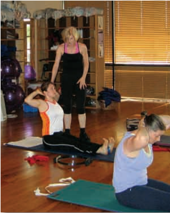
Pilates Class at Kokopelli's (top) Construction on Main Street (bottom)