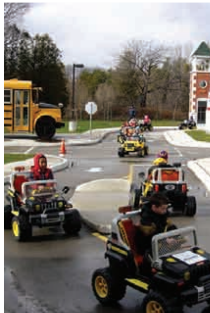
Example of Safety Town photo

Frisco Square, located off the Dallas North Tollway and Main Street, offers an integrated town center with restaurants, upscale retail, and commercial office space, apartments and town homes.