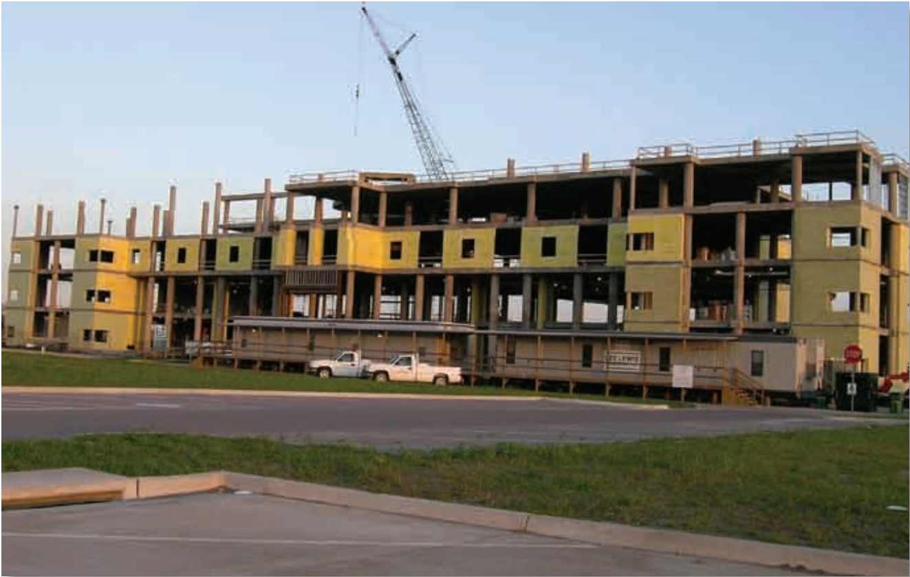
City Hall in progress