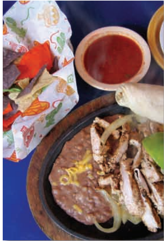
Manny's Tex Mex Grill (top), Enjoying a Martini on the patio at Terilli's (bottom)