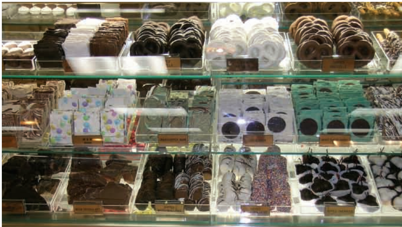
Rocky Mountain Chocolate Factory (above)