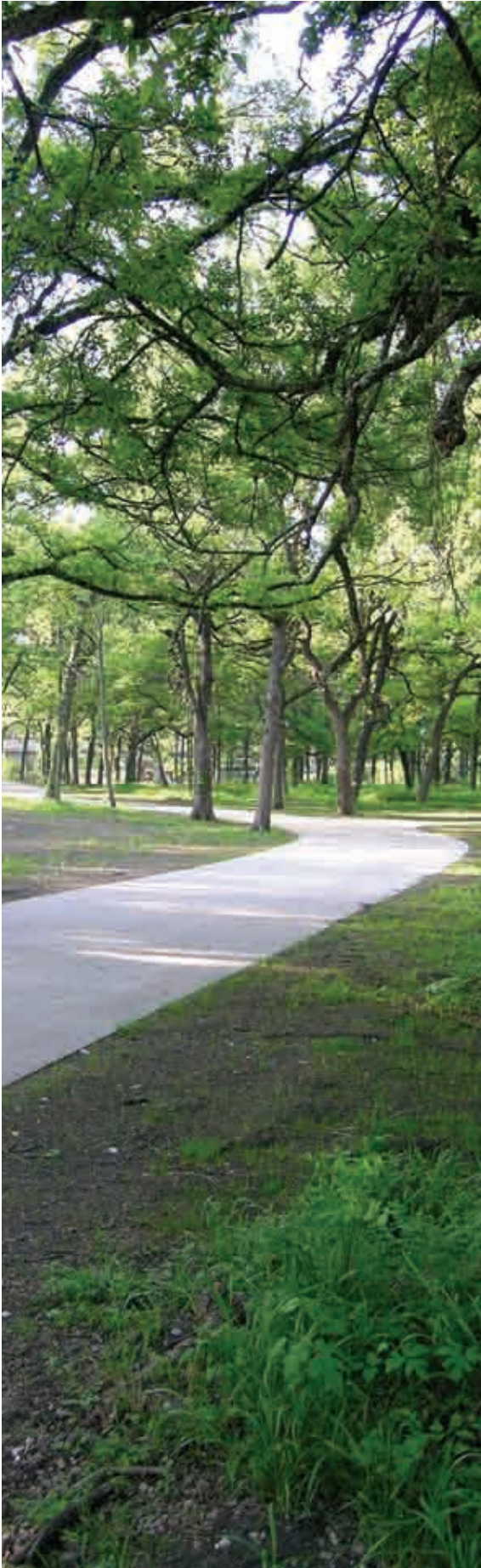
Hunters Creek Bike Trail (left) Self-Portrait (below)

trail takes you over a bridge spanning a delightfully bubbling creek and winds through tall, lush trees reminiscent of a secluded forest. If you're so inclined, stop by the fish-stocked pond that sports sparkling water features, relax in the covered gazebo or roast hotdogs on the grills provided. Spread out your blanket on the large rocks overlooking the pond or dine on the picnic tables nearby. If little ones are with your group, they'll delight in the playground, complete with swings and seesaws.