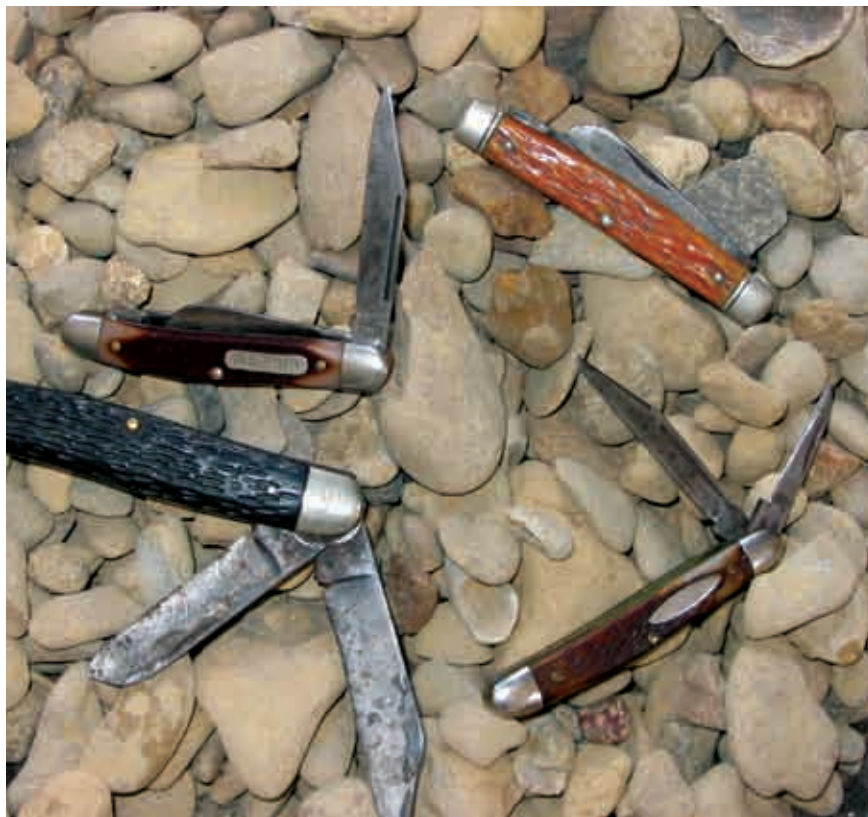
Pocket Knives