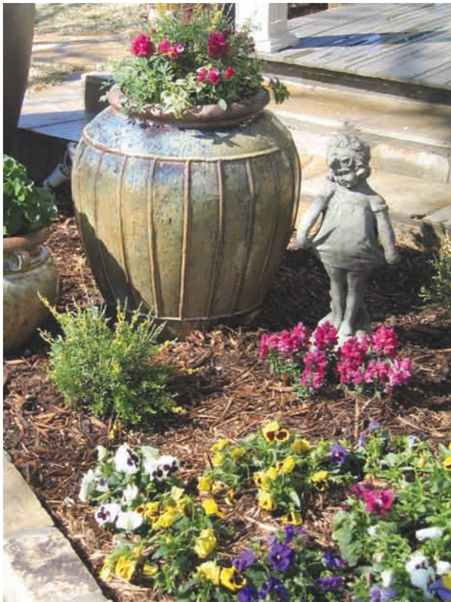
Two garden displays from Heritage Exteriors

normally associate with interior décor, such as adding a chandelier to a covered space or sconces with fragrant candles. You can find a variety of chandeliers with different finishes at reasonable prices at Lowe's and Home Depot. The Home Depot EXPO has a nice selection also.