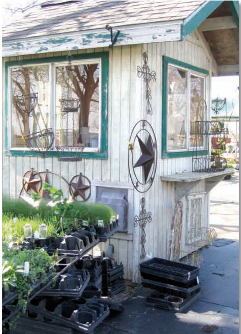
Ironworks at Shades of Green

Iron décor has become a number one accent for decorating rooms inside and out. I personally think it adds a different charm to your walls instead of always using pictures. For your outside, iron can be used anywhere. Choose pieces that fit your décor. The star is popular here in the Lone Star State. They look great over a fireplace or on an outside wall. It would look great with a more rustic motif. The larger more ornate wall pieces are great if you want to dress up your outdoors. Look for trellis pieces that can stand in your garden as a backdrop for your flowers. Also, in some of the stores I have seen smaller pieces that link together as a border. Don't go crazy and put this everywhere. But it is a fun accent maybe on a curve or a smaller flowerbed. An old gate can also be used as a trellis by mounting it and placing a potted plant