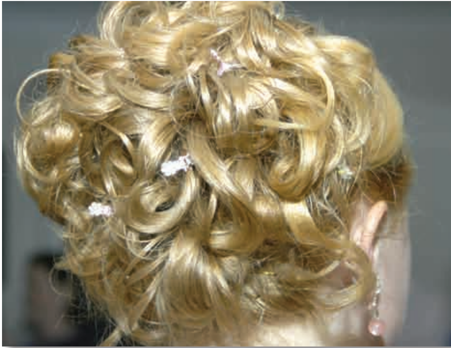
Prom-Perfect "Up-do"

Lenz Boutique, prom is such an important night for teenage girls and they want to feel special.