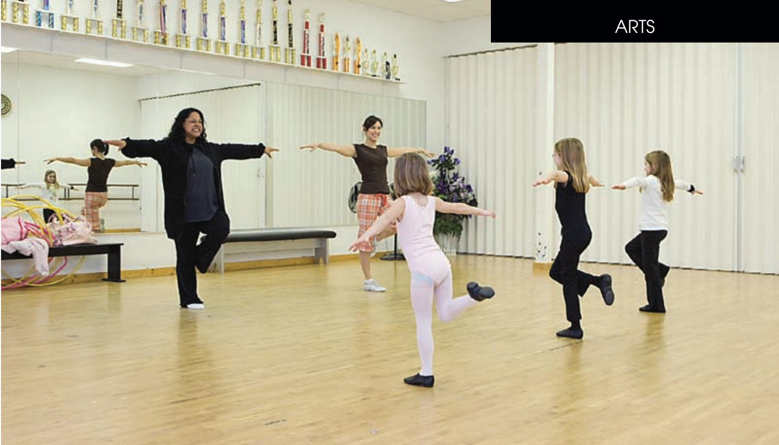
Broadway bound – students at Frisco Dance Force