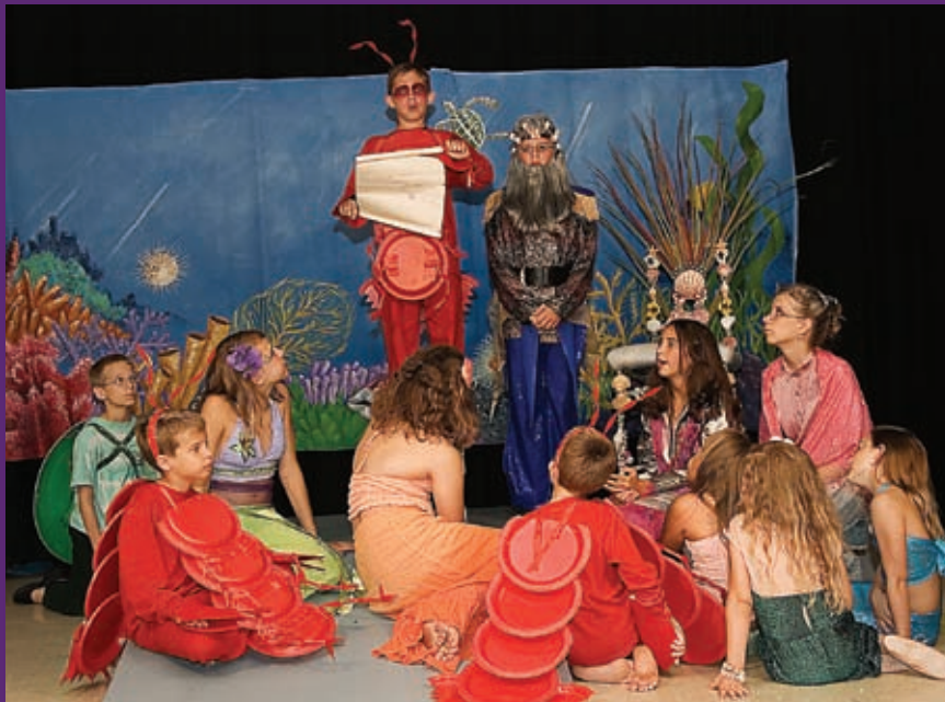
Frisco Area Children's Theater production of The Little Mermaid